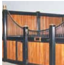
Swooping Wall Designs