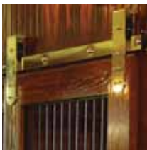
Solid Brass Details