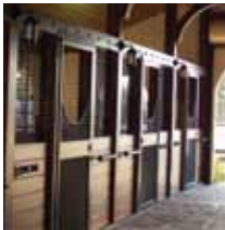
High Wall Designs