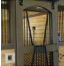
Folding V Yokes