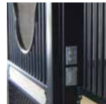
Concealed Electrical Systems