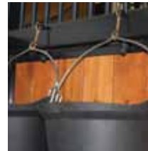
Integrated Water Systems